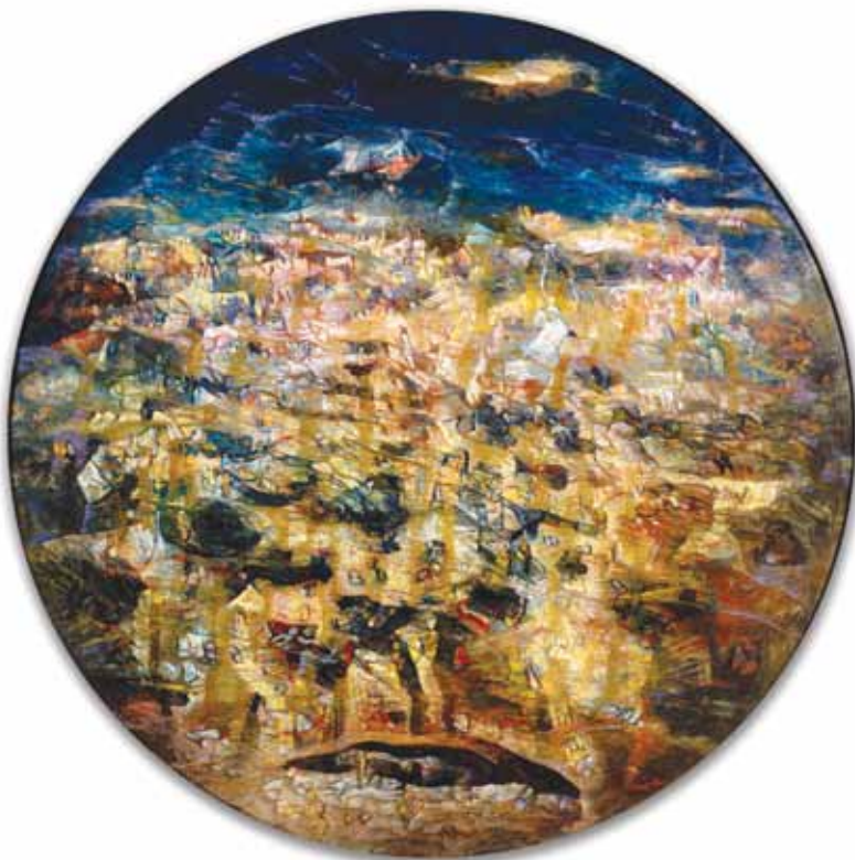
Abdallah Benanteur. Le Témoin , 1991 Oil on canvas diam. 130 cm © Abdallah Benanteur Courtesy Galerie Claude Lemand, Paris