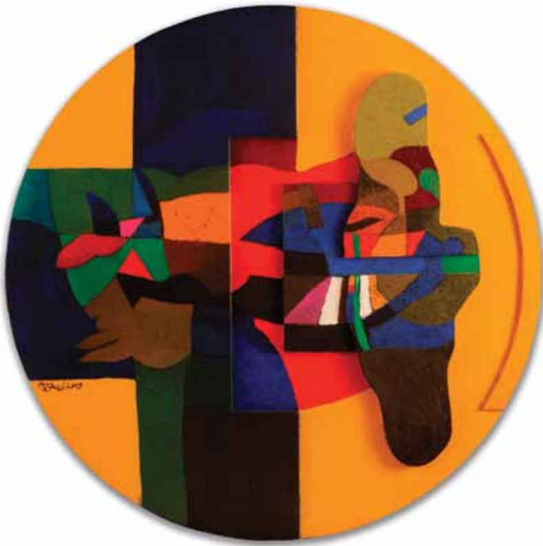
Dia Al-Azzawi. Sunny Day , 2009 Acrylic on wood panel, diam. 190 cm © Dia Al-Azzawi Courtesy Galerie Claude Lemand, Paris