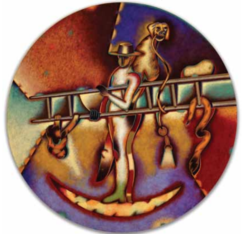
Saul Kaminer. Equilibrista , 2000 Oil on canvas, diam. 120 cm © Saul Kaminer Courtesy Galerie Claude Lemand, Paris