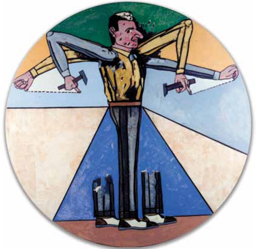
Antonio Segui. Manpower 1, 1999 Acrylic on canvas, diam. 120 cm

T ondo paintings featured in the collection are by: Sam Francis (USA), Joan Mitchell (USA), Shafic Abboud (Lebanon), Dia Al-Azzawi (Iraq), Abdallah Benanteur (Algeria), Antonio Segui (Argentina), Vladimir Velickovic (Yugoslavia), Bengt Lindström (Sweden), Saul Kaminer (Mexico), Manabu Kochi (Japan), Zoulikha Bouabdellah (France), Pat Andrea (Netherlands) and Rashid Al Khalifa (Bahrain).