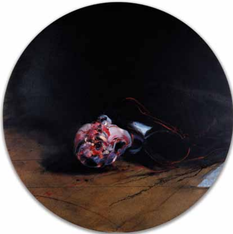
Velickovic. Execution , 1998 Oil on canvas, diam. 120 cm © Vladimir Velickovic Courtesy Galerie Claude Lemand, Paris