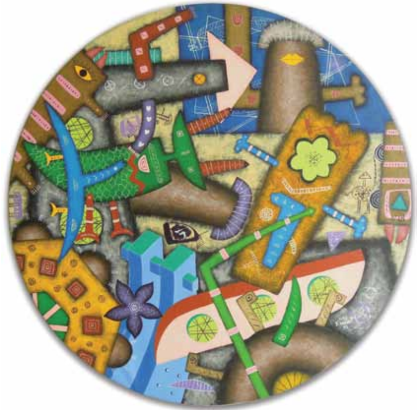
Manabu Kochi. Autre réalité , 1992 Acrylic on canvas, diam. 80 cm © Manabu Kochi Courtesy Galerie Claude Lemand, Paris