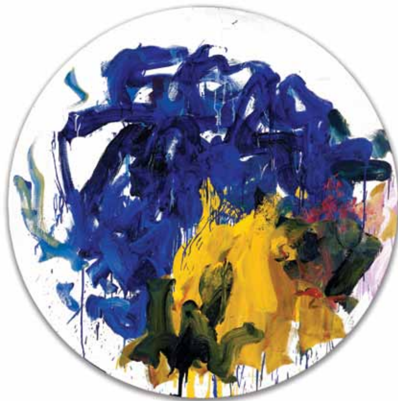
Joan Mitchell. Tondo, 1991 Oil on canvas, diam. 150 cm