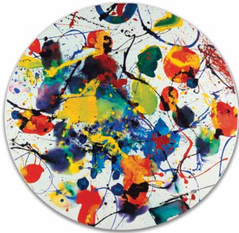
Sam Francis. Tondo , 1987 Oil on canvas on wood panel, diam. 150 cm © The Sam Francis Foundation Courtesy Galerie Claude Lemand, Paris