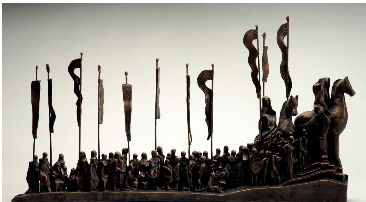
Suspiro del Moro , 2014. Bronze original, 48 x 86 x 18 cm. Édition de 7 + 2 EA.

© Dia Al-Azzawi. Courtesy Galerie Claude Lemand, Paris.